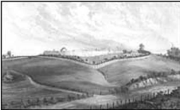
Historical Fort Mitchell

through today, as Congress has recently enacted legislation honoring six contemporary Americans