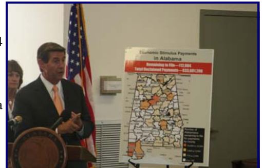
Gov. Bob Riley urges Alabama citizens to file for the economic stimulus payment at an Aug. 4 press conference held at the Shiloh Baptist Church in Montgomery.

The IRS and United Way in Alabama will help people file their 2007 tax form to receive the stimulus payment at no cost. The public can call the IRS offices in Birmingham, Dothan, Florence, Huntsville, Mobile or Montgomery; the IRS toll free number at 1-800-829-1040; or visit the IRS Web site at www.irs.gov. The United Way also has a helpline at 211, or 1-866-869-4921.