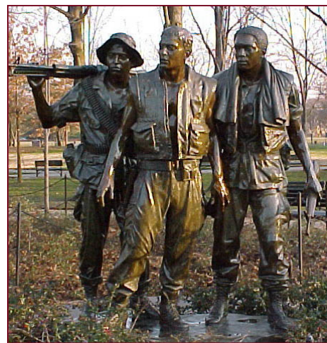
The "Statue of the Three Servicemen" in Washington, D.C., honors Vietnam veterans, living and dead, who served in the war.

Additional information on the history of Veterans Day, can be found on the Internet at http://www.va.gov/vetsday/ .